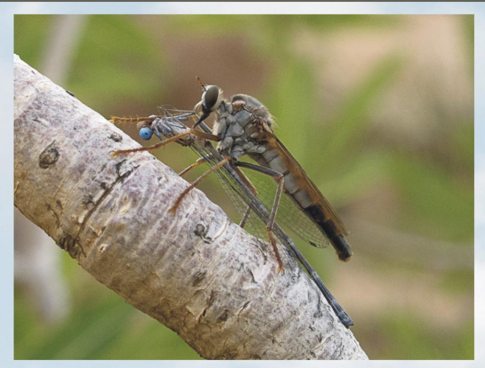
Microstylum sp. with prey (Azuragrion granti)

Robber flies have mostly a slender shape and rather long legs with stiff spines. They attack other insects and insert their robust snout (of probiscus) into the victim's body in order to digest the insides (see picture on the right). Robber flies often sit on the ground or on branches and stems. Robber flies detect preys with their excellent eyes and catch them after a short chase. The fauna of Socotra holds around 15 species.