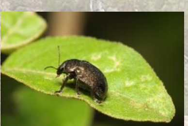
Colasposoma atrocyaneum (left) and Colasposoma sp. (right) are leaf beetles (family Chrysomelidae).