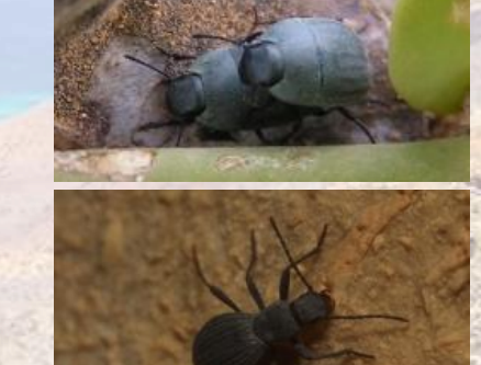
The darkling beetles Zophosis aequalis (top) and Mesostena socotranensis.

Probably the species richest family on the island with 53 known species (8 genera are endemic – they only occur on this island). Except for genera Zophosis and Socotralia, most of them are crepuscular and nocturnal (active in the dusk and night respectively). They are adapted to arid and semi-arid conditions and can be found from lowland parts to high mountain altitudes on different habitats and possess various modes of life – e.g. they live in sandy dunes (psammophilous genus Trachyscelis), on trees (arboreal general Deretus, Corticeus), in detritus (endogean genus Nanocaecus) and so on.