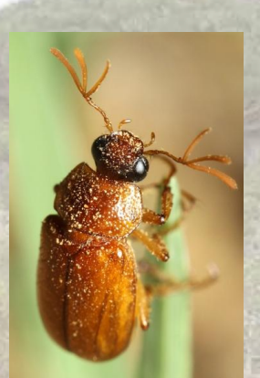
The predacious diving beetle (family Dytiscidae) Cybister tripunctatus africanus

Canuschiza sp. - the cockchafer beetle (family Scarabaeidae).