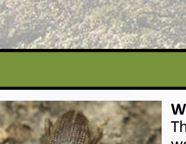
Unknown member of the family Curculionidae.

The long-horbed beetles Mallodon arabicum (left) and Idactus hieroglyphicus (right).