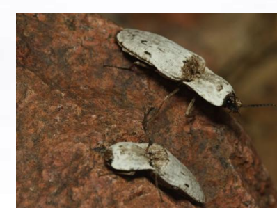
The click beetle Calais sulcicollis.

The species most numerous beetle family in the world. In adults the head is produced into long or shorter rostrum which bears the elbowed antennae. Weevils are herbivorous beetles which develop primarily in living or dead plant tissues. In Socotra they are represented by several dozens of undescribed species.